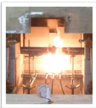
Fig. 3: API-607 TEST PROCESS

Fire exposure tests including API-607 and UL-852 are used routinely to qualify new seal materials and coupling designs that are intended for high hazard applications where the inherent risk of fire is always present. Such standards can involve direct flame temperatures exceeding 871°C (1600°F) as part of the qualification requirements for components used in dry fire protection systems.