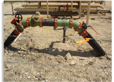
Fig. 5: Mixed Material Example